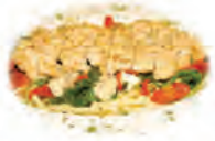
Mediterranean Chicken "Pacino's - A+++"